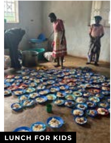
LUNCH FOR KIDS