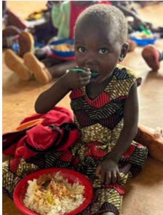
NSANGANIZA CARE CENTER STUDENT

Due to extreme conditions the need for food has grown substantially. Would you pray for increased financial support at CRI that we might be able to provide more food to those in need?