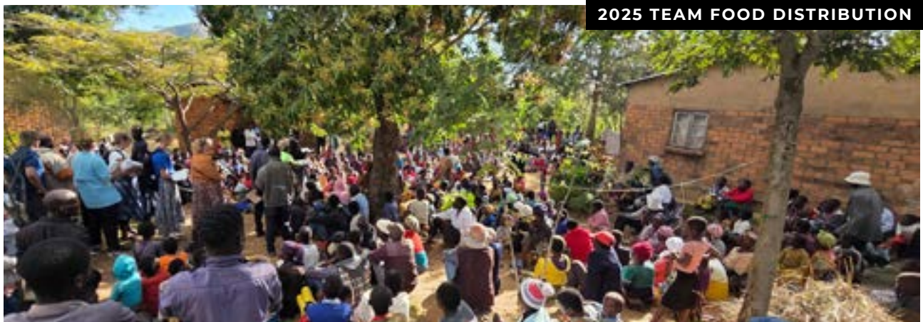
2025 TEAM FOOD DISTRIBUTION

We would love to have you pray for the team. As you feel led, would you consider donating to their travel expenses and ministry needs? Each team member needs to raise $4,000, half of which is due on or before May 12th.