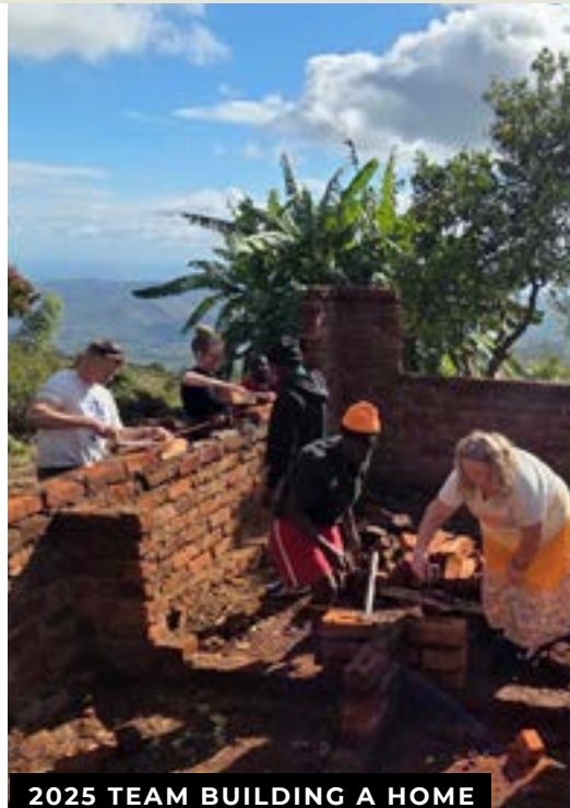
2025 TEAM BUILDING A HOME

These individuals will be visiting and praying for the sick, caring for children at the Nsanganiza care center, hosting worship services, sharing food distributions and the gospel, and helping build a green door home.