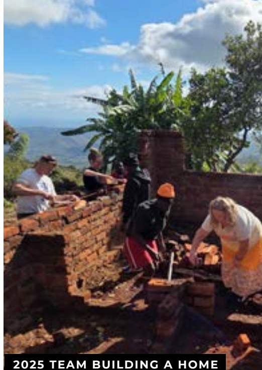
2025 TEAM BUILDING A HOME

These individuals will be visiting and praying for the sick, caring for children at the Nsanganiza care center, hosting worship services, sharing food distributions and the gospel, and helping build a green door home.